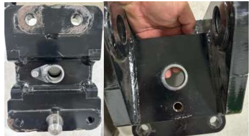
Figure 1B & 1C