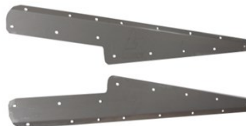
LANPSP602L & LANPSP602R