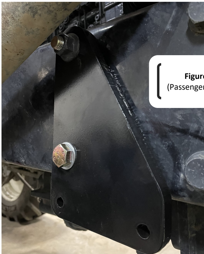
Figure 5 (Passenger's Side)