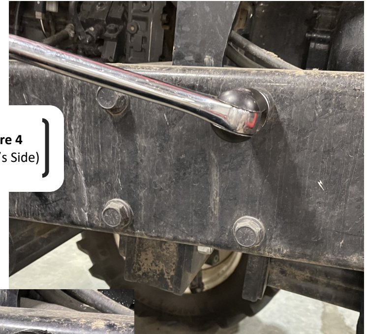
Figure 4 (Driver's Side)